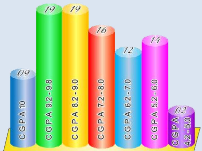
Students Wise CGPA

Please send your write-ups / suggestions / comments at: editor@tcdav.org , ss.tcdav@gmail.com