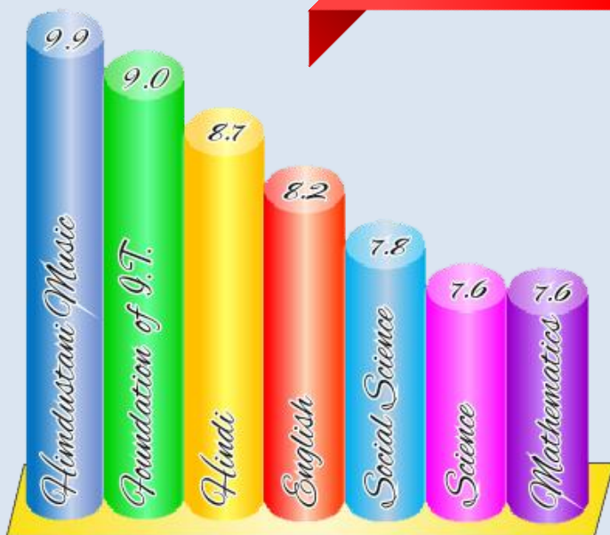
Subject Wise CGPA