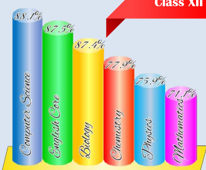
XII-Sc. Subject Wise Average